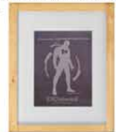
EXOSTENCIL® Screen Prep Paper